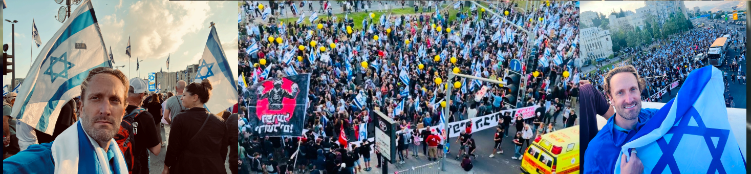
Row 1-3 L to R: IDF soldiers (faces blurred for protection) at the Gaza Border before ceasefire, Destruction on Kibbutzim Bottom: L to R "Bring them home," March from Tel Aviv to Jerusalem Background: Cactus at near Gaza