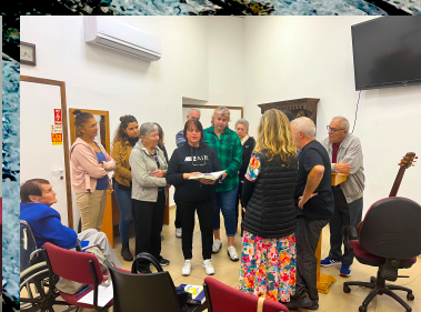
November services at For Zion's Sake Congregation, Jerusalem, Clothing distribution, Picking up clothing in Ashdod. Background: Jerusalem from Mishkenot Sha'ananim (Peaceful Dwellings).